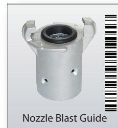
Nozzle Blast Guide