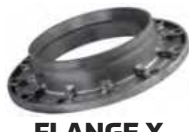
FLANGE X GROOVE ADAPTER